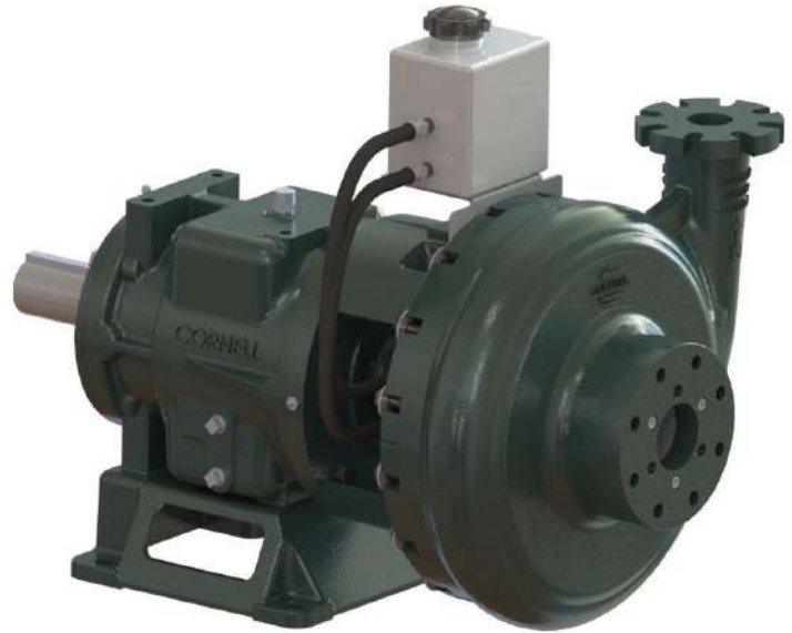
A typical picture of the pump is shown. Please contact Aquarius Pump Company for further details. All information is approximate and for general guidance only.