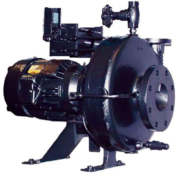
A typical picture of the pump is shown. Please contact Aquarius Pump Company for further details. All information is approximate and for general guidance only.