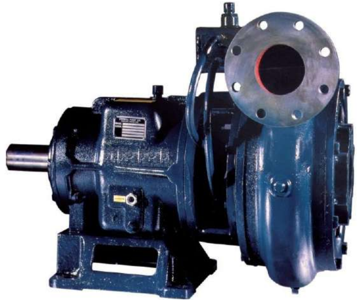
A typical picture of the pump is shown. Please contact Aquarius Pump Company for further details. All information is approximate and for general guidance only.