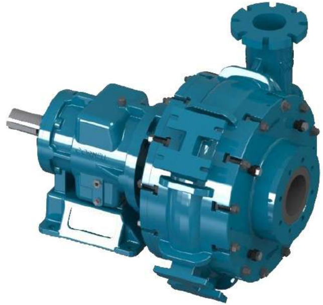
A typical picture of the pump is shown. Please contact Aquarius Pump Company for further details. All information is approximate and for general guidance only.