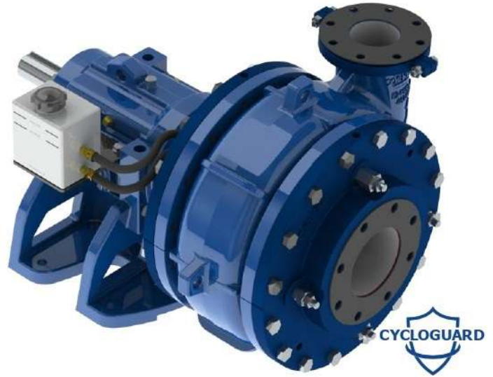
A typical picture of the pump is shown. Please contact Aquarius Pump Company for further details. All information is approximate and for general guidance only.