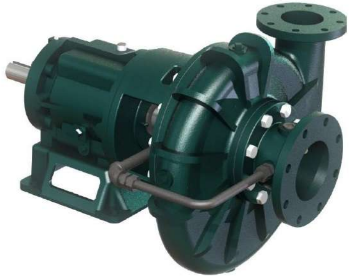
A typical picture of the pump is shown. Please contact Aquarius Pump Company for further details. All information is approximate and for general guidance only.