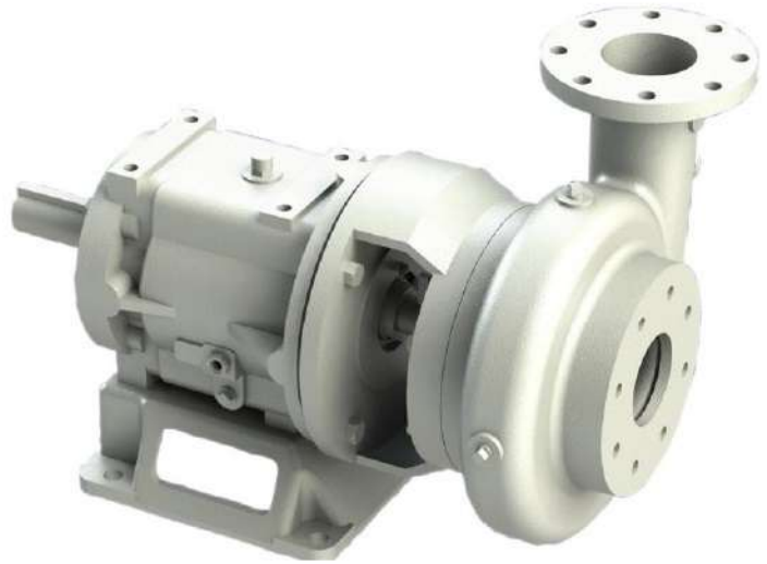
A typical picture of the pump is shown. Please contact Aquarius Pump Company for further details. All information is approximate and for general guidance only.