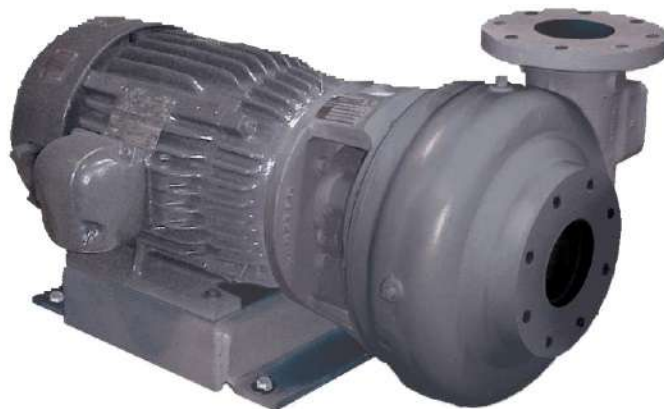
A typical picture of the pump is shown. Please contact Aquarius Pump Company for further details. All information is approximate and for general guidance only.