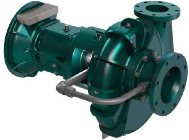
A typical picture of the pump is shown. Please contact Aquarius Pump Company for further details. All information is approximate and for general guidance only.