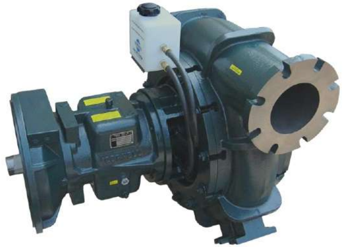
A typical picture of the pump is shown. Please contact Aquarius Pump Company for further details. All information is approximate and for general guidance only.