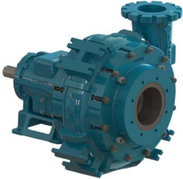
A typical picture of the pump is shown. Please contact Aquarius Pump Company for further details. All information is approximate and for general guidance only.