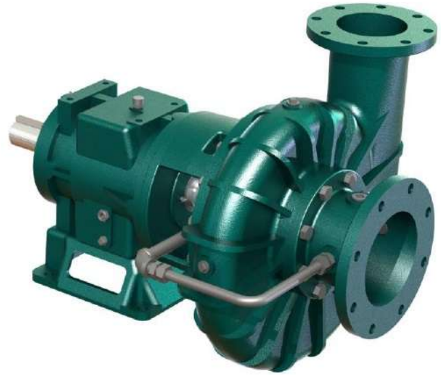
A typical picture of the pump is shown. Please contact Aquarius Pump Company for further details. All information is approximate and for general guidance only.