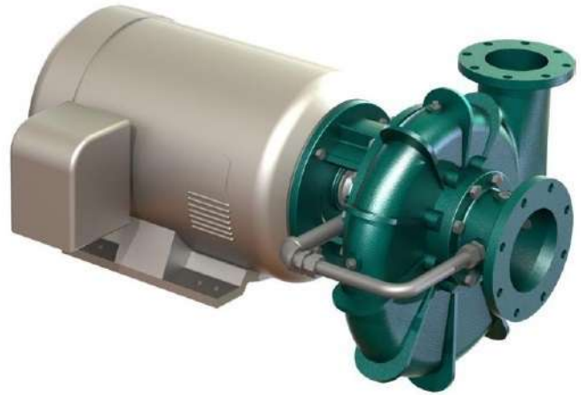
A typical picture of the pump is shown. Please contact Aquarius Pump Company for further details. All information is approximate and for general guidance only.