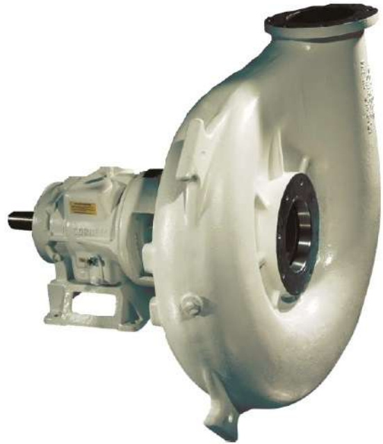
A typical picture of the pump is shown. Please contact Aquarius Pump Company for further details. All information is approximate and for general guidance only.