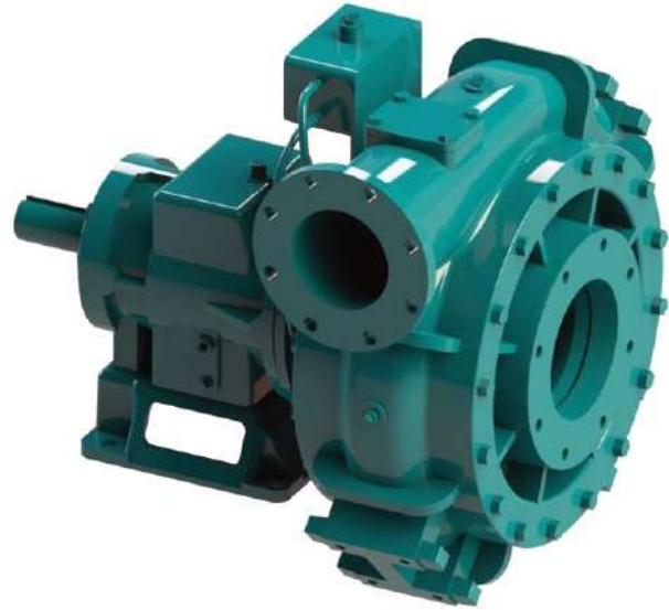
A typical picture of the pump is shown. Please contact Aquarius Pump Company for further details. All information is approximate and for general guidance only.