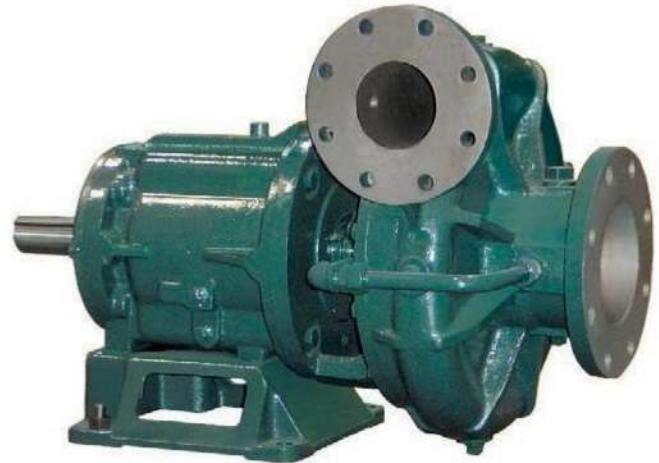
A typical picture of the pump is shown. Please contact Aquarius Pump Company for further details. All information is approximate and for general guidance only.

The 6RB general purpose pump is designed with Aquarius's renowned quality and durability. It features a 6" discharge and a 10" suction, enclosed multi-vane impeller and flanged tangential double volute.