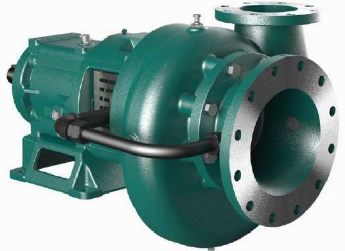
A typical picture of the pump is shown. Please contact Aquarius Pump Company for further details. All information is approximate and for general guidance only.