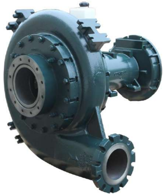
A typical picture of the pump is shown. Please contact Aquarius Pump Company for further details. All information is approximate and for general guidance only.