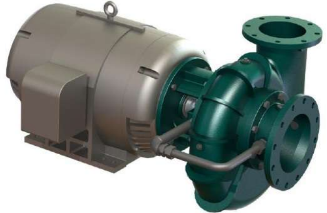
A typical picture of the pump is shown. Please contact Aquarius Pump Company for further details. All information is approximate and for general guidance only.