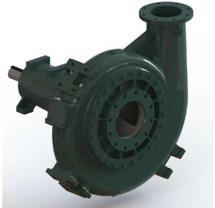
A typical picture of the pump is shown. Please contact Aquarius Pump Company for further details. All information is approximate and for general guidance only.